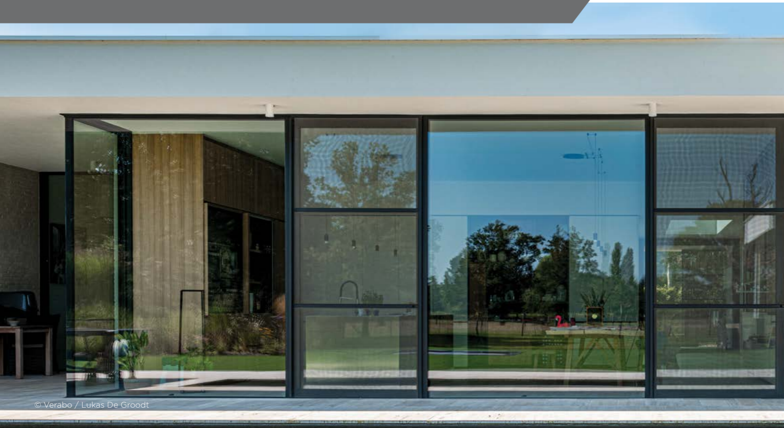
© Verabo / Lukas De Groot